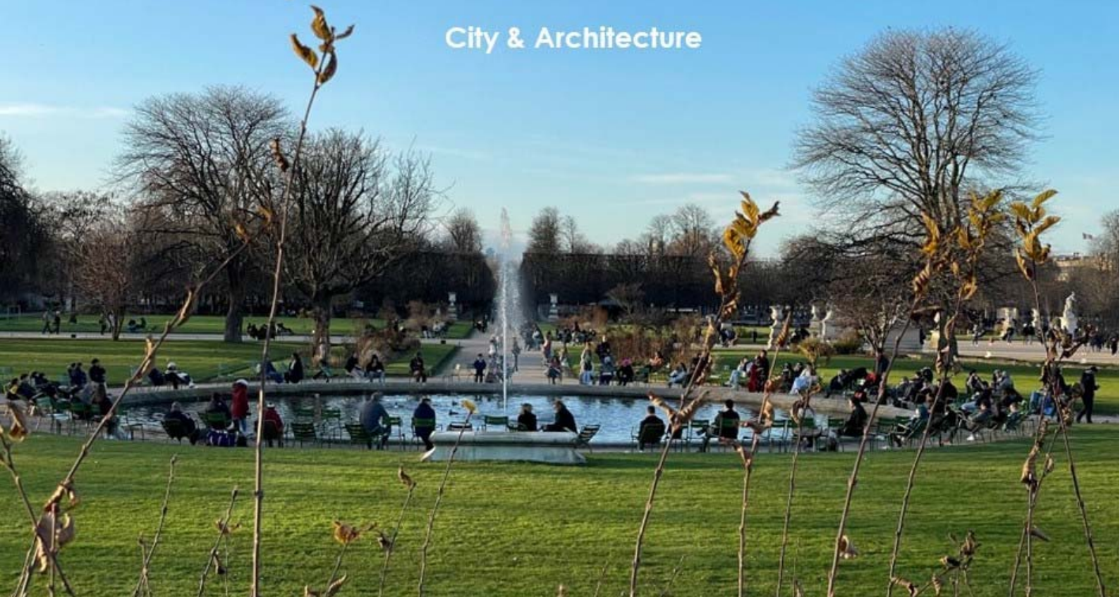
Jardin des Tuileries, Paris, December 2022