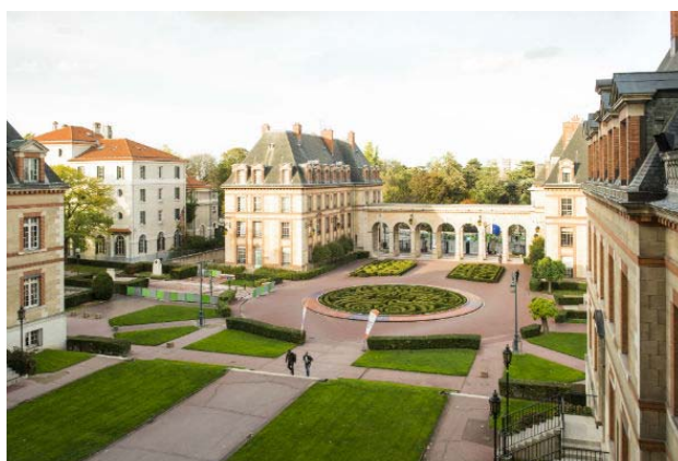
The Campus of the Cité Internationale

The building, designed by the architect Nicolas Zahos and inaugurated during the interwar period, combines a neoclassical style with Art Deco references. The Hellenic Foundation was entirely renovated in 2021 and all of its rooms have private shower rooms, toilets and kitchenettes.