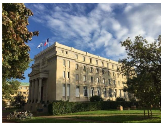
The building of the Fondation Hellénique